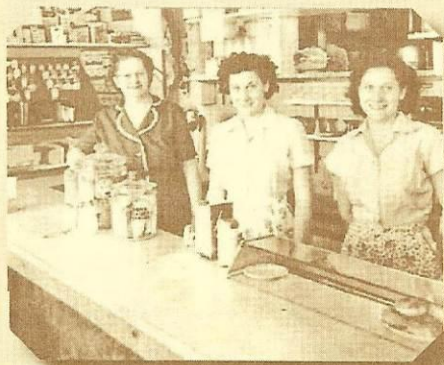
• Inside the Dogpatch restaurant

The store bears the name of a fictional town in Al Capp's comic about Appalachian hillbillies Li'l Abner , and over the years Tietmeyer developed the shop into an area themed around the mythical Ozark mountain pioneer lifestyle. The store took much of