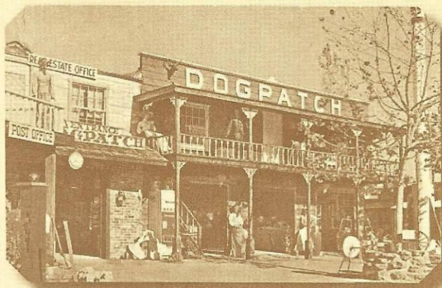
• A display featuring the “hillbilly” life

Despite this small hurdle, by the '50s and '60s the store had become a well known tourist attraction with thousands of visitors annually.