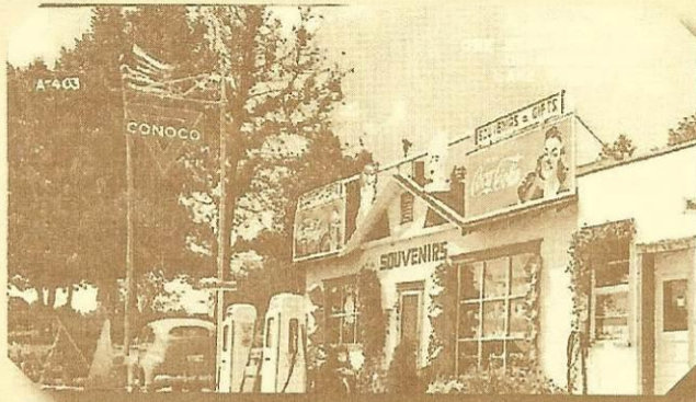
• Dogpatch as it first looked in the '40s