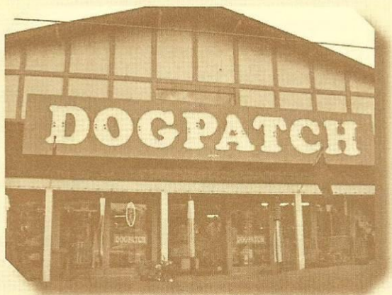
• Dogpatch today

The people who have explored the Strip know Dogpatch is a Lake of the Ozarks tradition. It is the longest continually operated store at the Lake. It's a place where parents whose own mom and pop brought them here during their childhood are now bringing their kids.