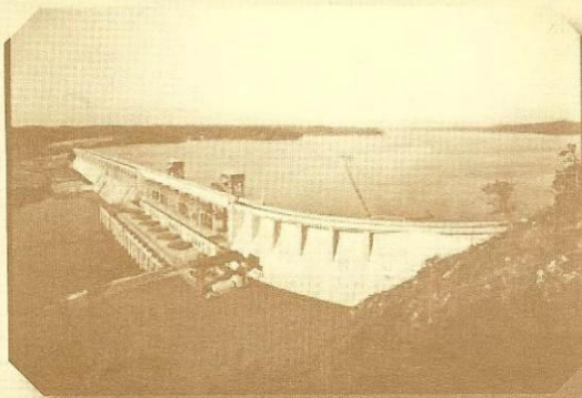
• Bagnell Dam in 1931

The Lake of the Ozarks story began 1931 when the floodgates of Bagnell Dam first cut off the Osage River. During dam construction, the area that would become the Bagnell Dam Strip was largely empty. Temporary towns or "tent cities" to house the thousands of construction workers for the project were built at the foot of the dam. Businesses opened to provide places to eat and to buy clothes and groceries.