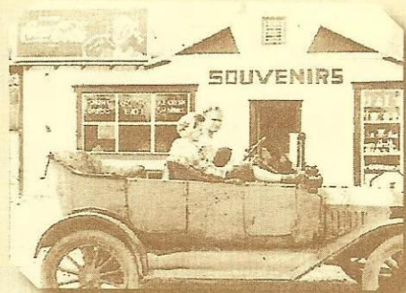
• Lake travelers in a Model T