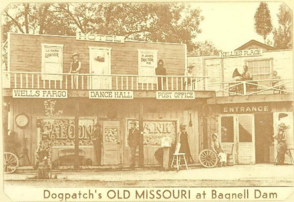
Dogpatch's OLD MISSOURI at Bagnell Dam Early postcard of one of Dogpatch's famous displays