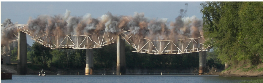
Karen Smith captured this great photograph of the old bridge at the moment of implosion